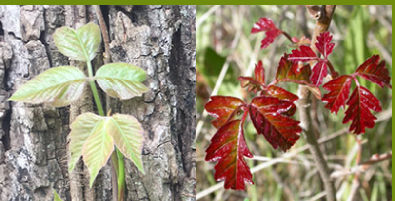
Eastern Poison Ivy

Once the temperature warms up in your part of the country, the poison ivy and poison oak plats' leaves will begin to emerge from their buds. The immature leaves start out with a red, waxy appearance. As the leaves grow they turn green. Below are some pictures to help you identify these plants.