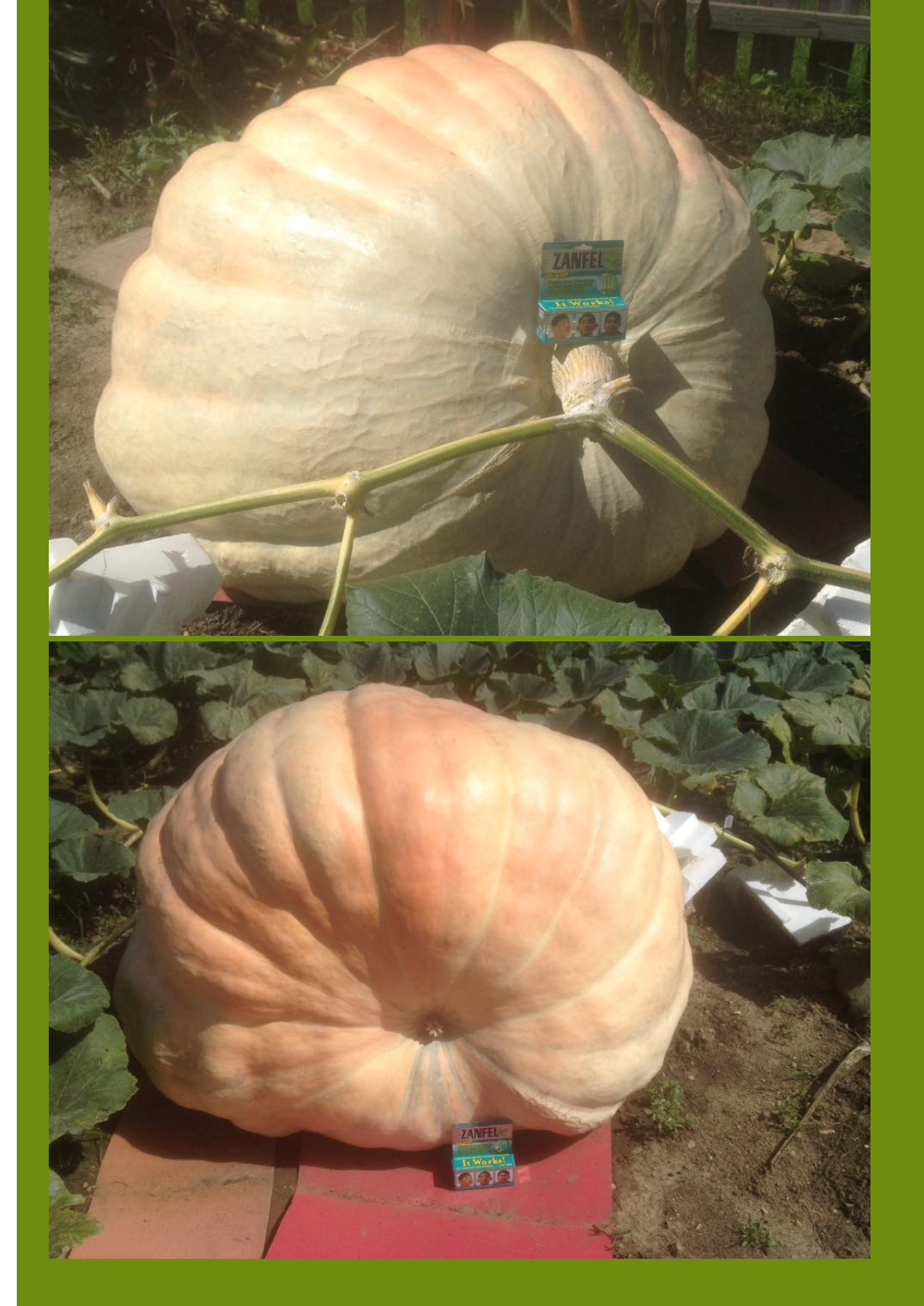
Michelle's orange beauty was harvested earlier this week and weighed 705 pounds!