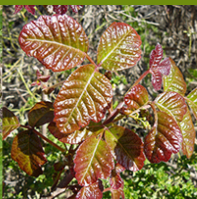
Western Poison Oak