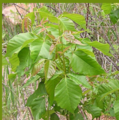
Western Poison Ivy