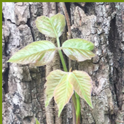
Eastern Poison Ivy

Once the temperature warms up in your part of the country, the poison ivy and poison oak plants' leaves will begin to emerge from their buds. The immature leaves start out with a red, waxy appearance. As the leaves grow they turn green. Below are some pictures to help you identify these plants.