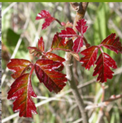
Eastern Poison Oak